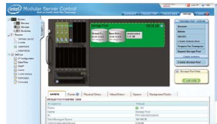
Under the Storage Configuration window, you can create storage pools and virtual drives, as well as map virtual drives to servers