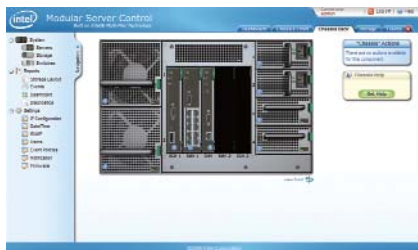
The back view of the chassis allows you to see the status of your modules and power supplies